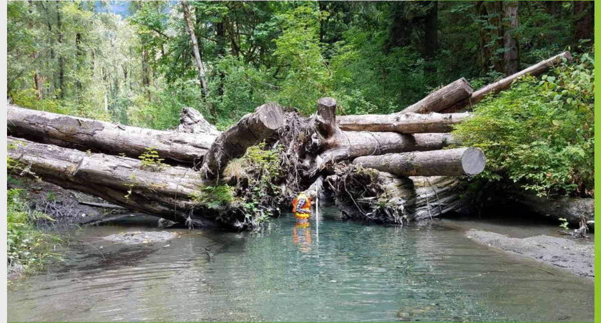
Example of large wood structure design for Chatham Acres