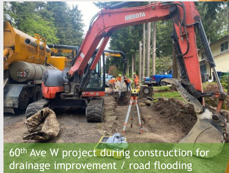
60 th Ave W project during construction for drainage improvement / road flooding