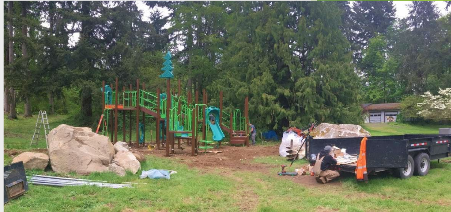
Corcoran Memorial Park Playground