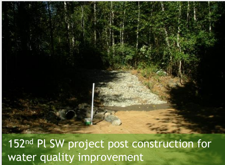
152 nd Pl SW project post construction for water quality improvement