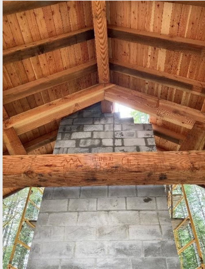
Whitehorse Campground Fireplace Construction