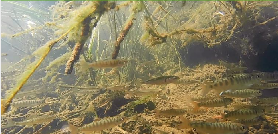
Juvenile salmon near Thomas' Eddy