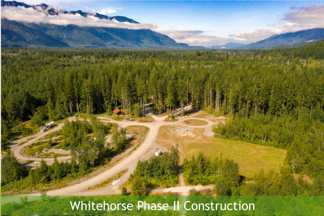
Whitehorse Phase II Construction