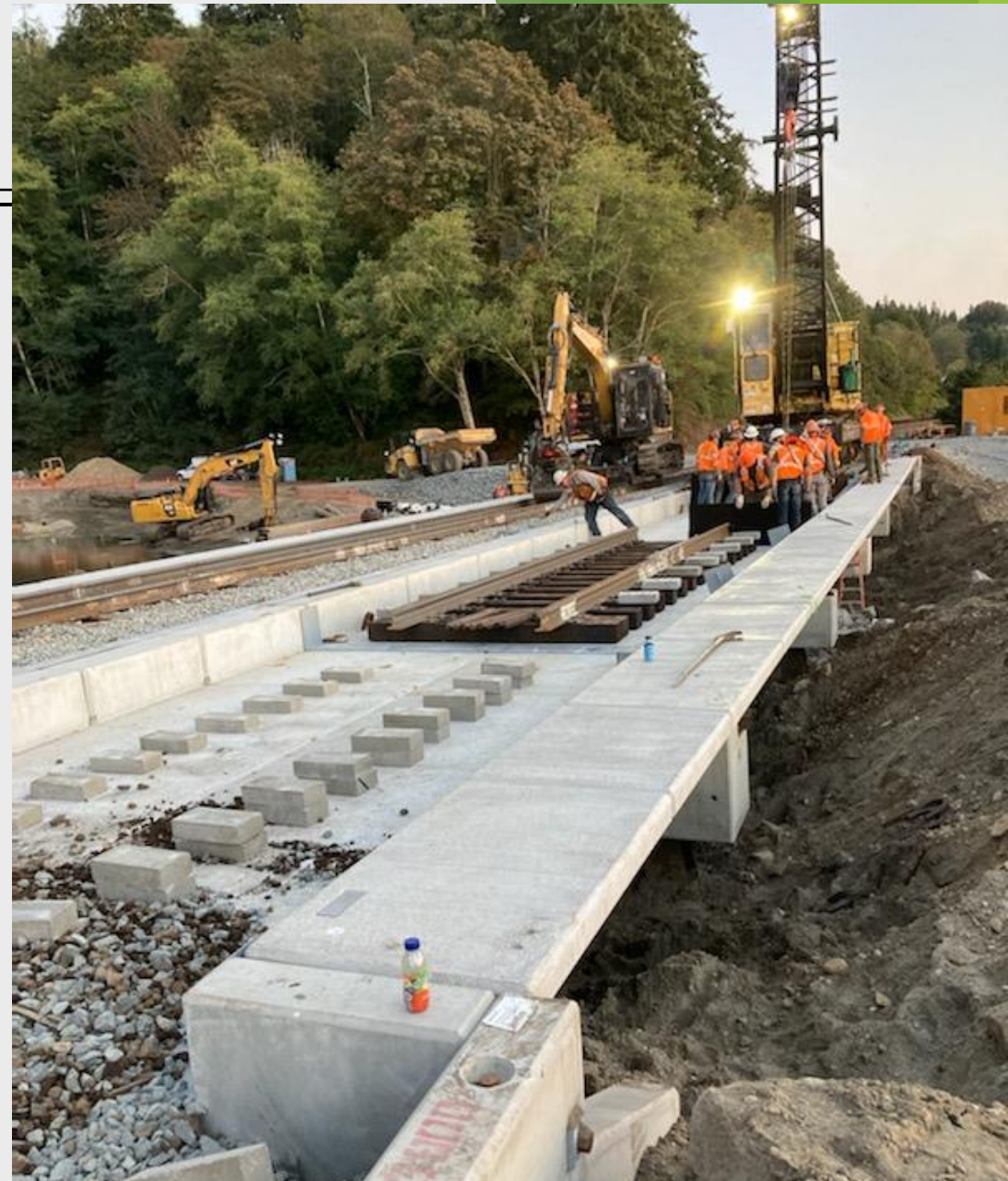
Meadowdale Bridge Install