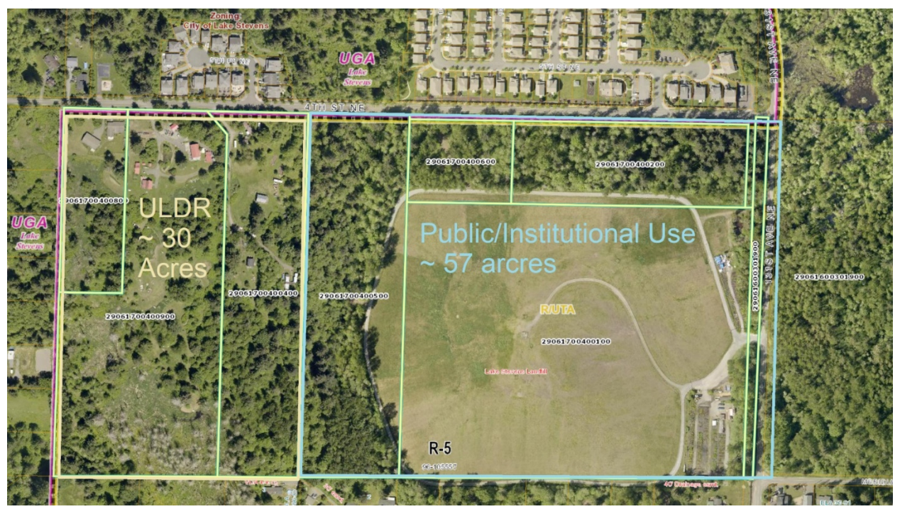
Figure 4 – Lake Stevens Landfill and Adjacent Parcels

The expansion proposed in this area is approximately 86 acres located south of 4<sup>th</sup> Street NE and west of 131<sup>st</sup> Ave NE. The main part is a closed landfill owned by Snohomish County. The rest is made of three residential parcels that would otherwise be surrounded on three sides by UGA.