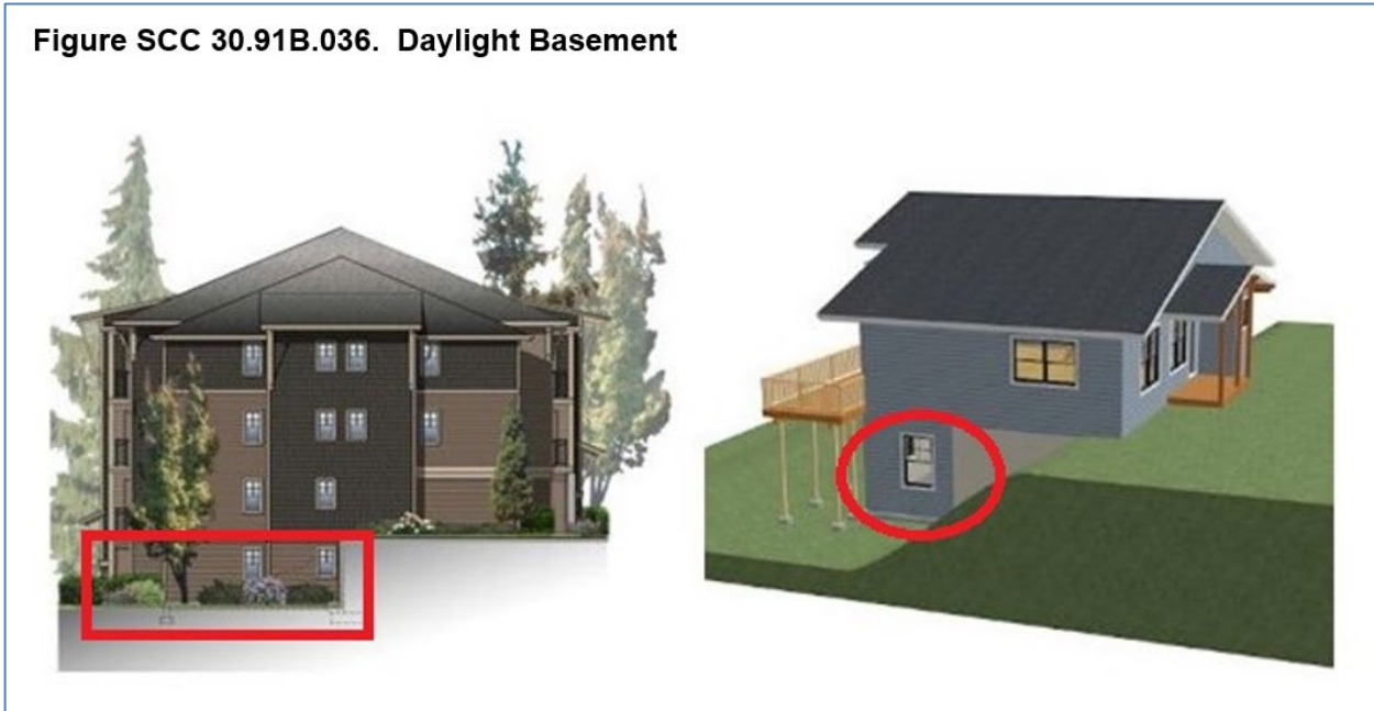
Proposed Figure SCC 30.91B.036