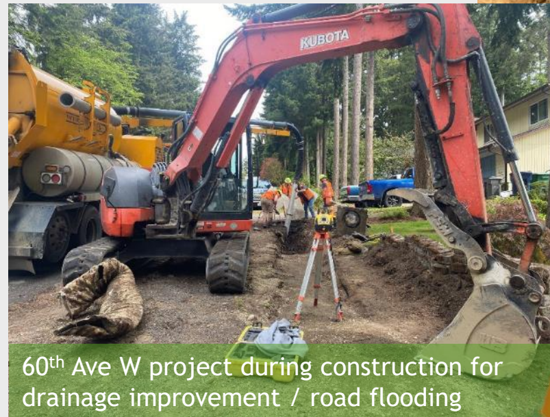
60 th Ave W project during construction for drainage improvement / road flooding