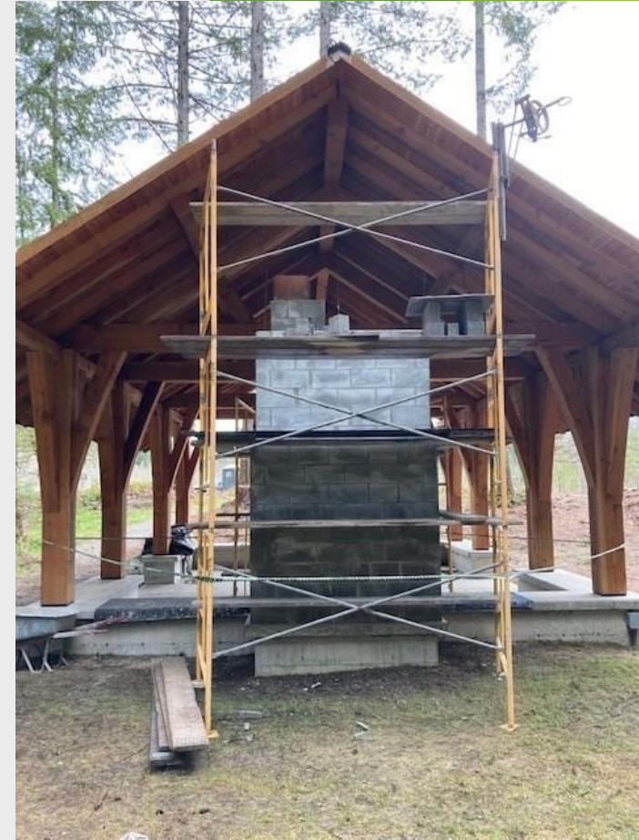
Whitehorse Campground Fireplace Construction