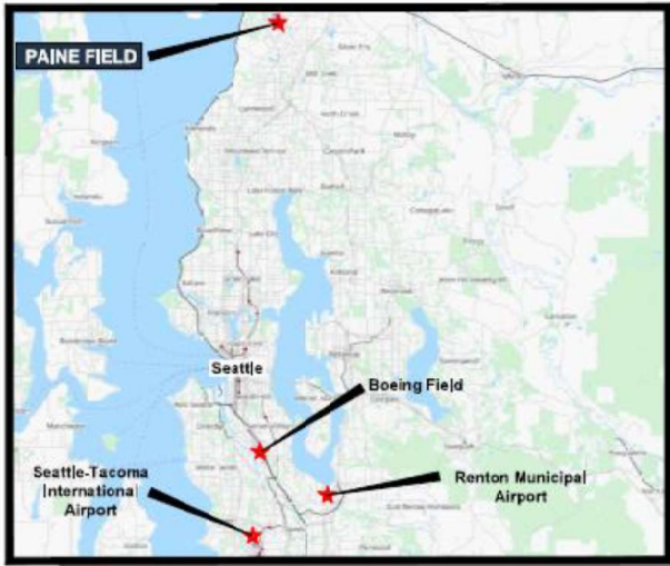
LOCATION MAP NTS