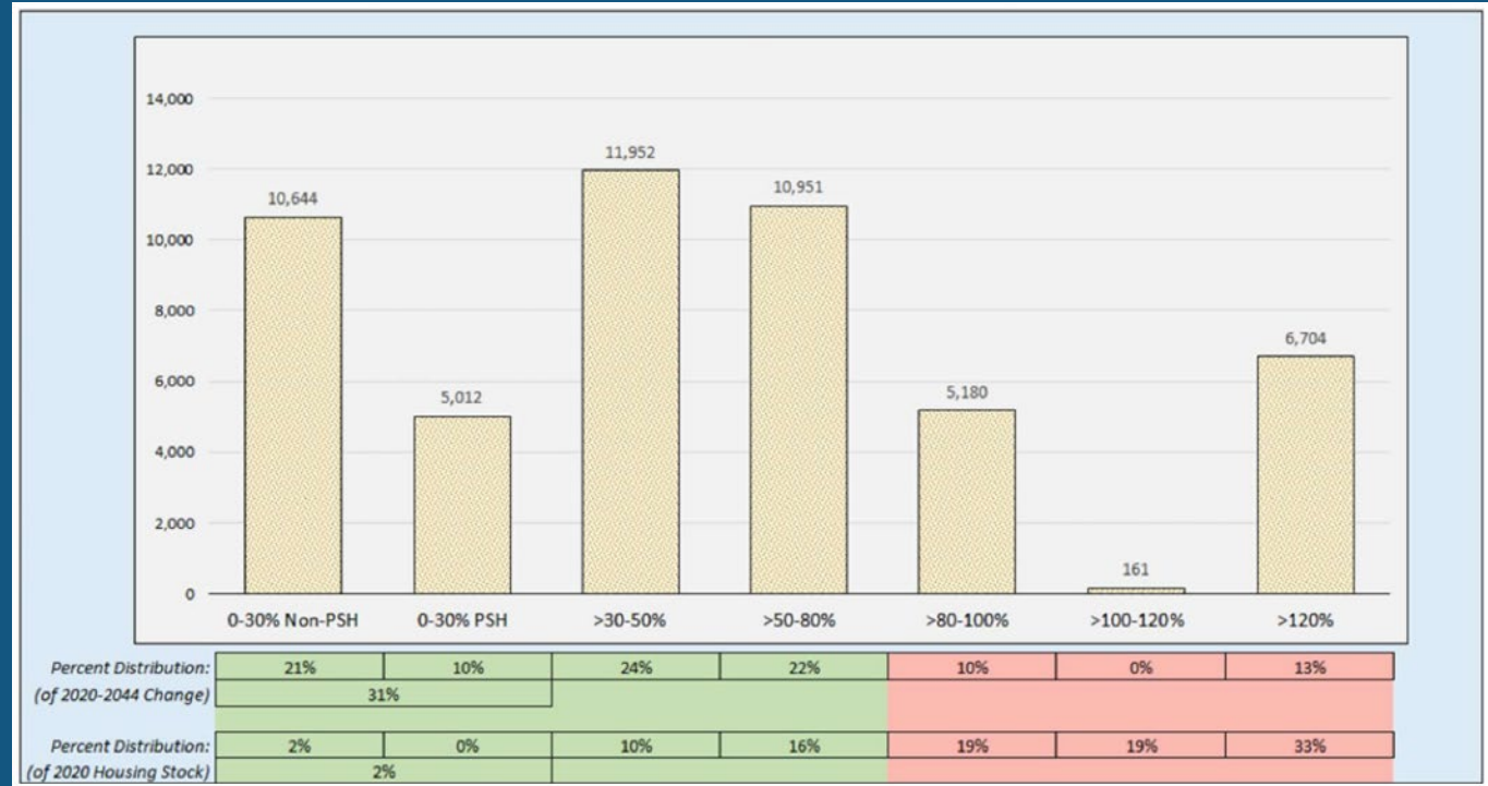
Snohomish County Unincorporated Housing Needs by Income Level (Area Median Income)