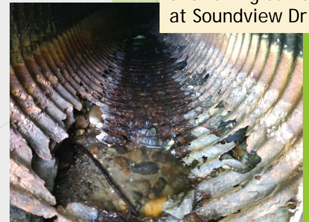
Fish passage barrier and failing culvert at Soundview Dr NW