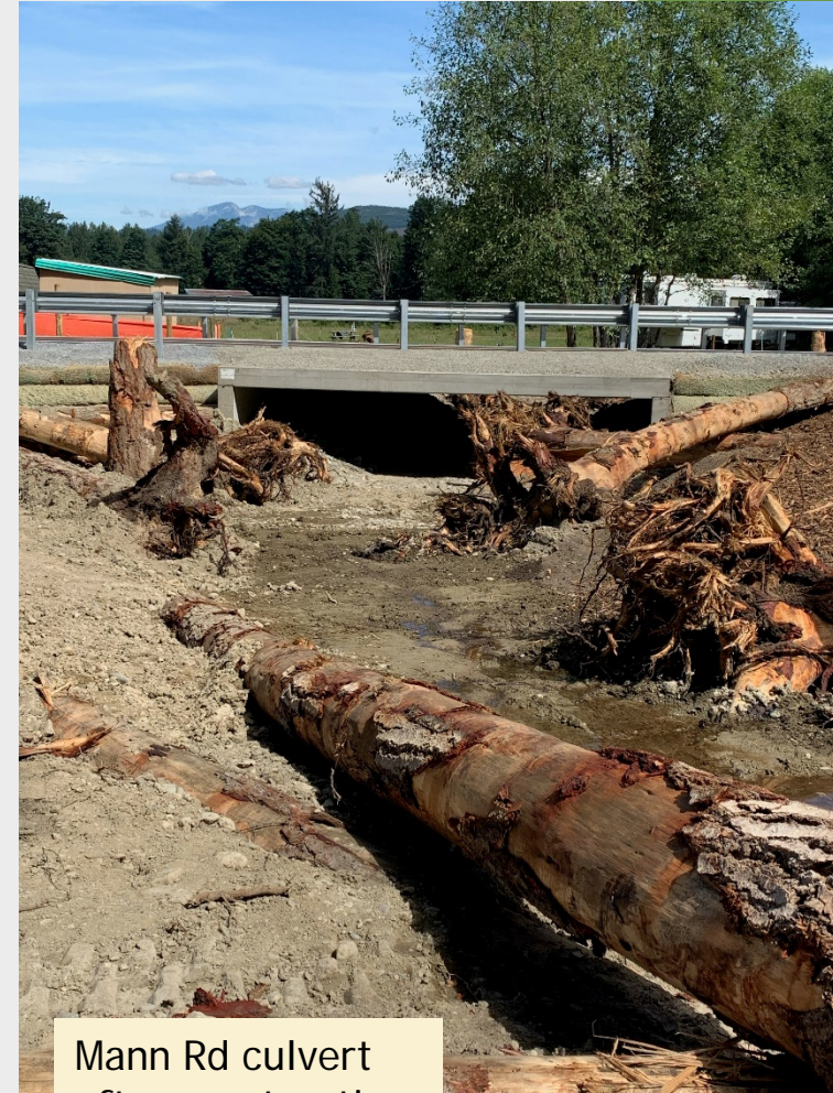
Mann Rd culvert after construction