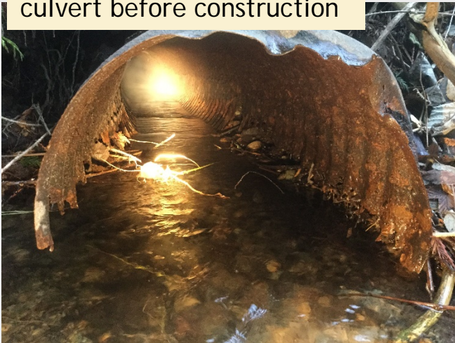
117 th ST SE failing road culvert before construction