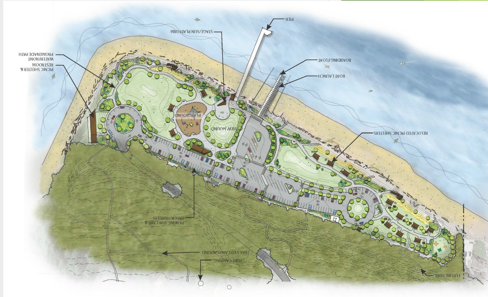
Kayak Point Day Use Renovation