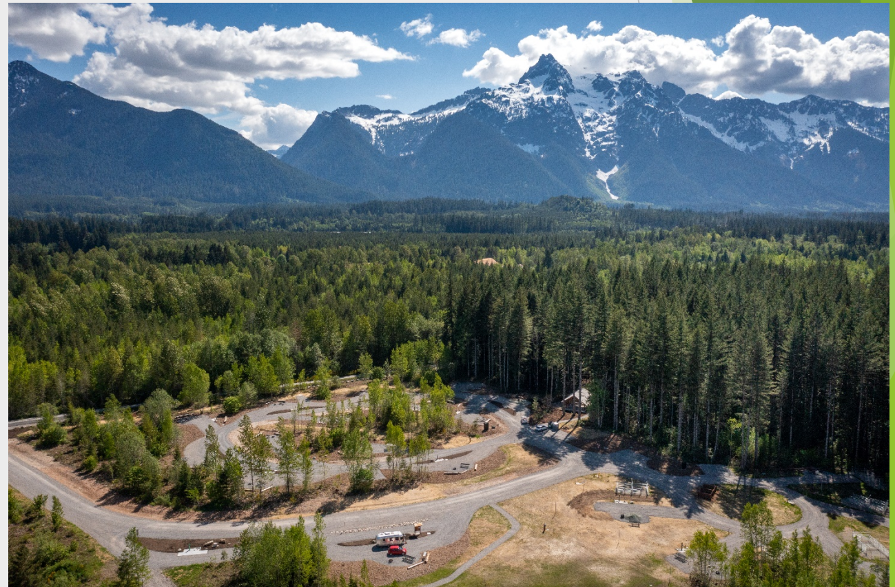
Whitehorse Campground, Phase I