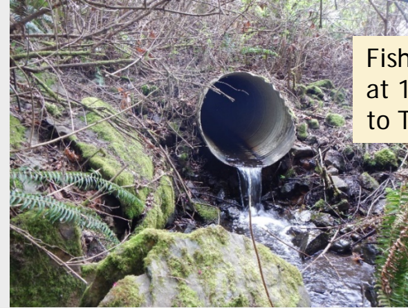
Fish passage barrier at 184 th PL SE (trib to Tambark Crk)