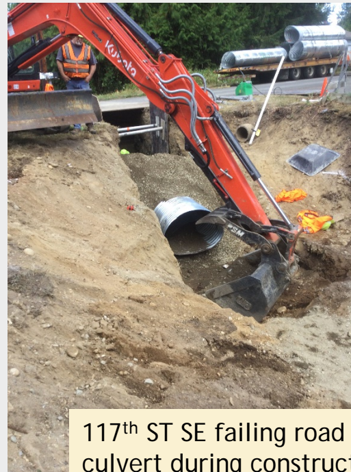
117 th ST SE failing road culvert during construction