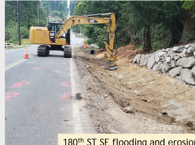
180 th ST SE flooding and erosion during construction