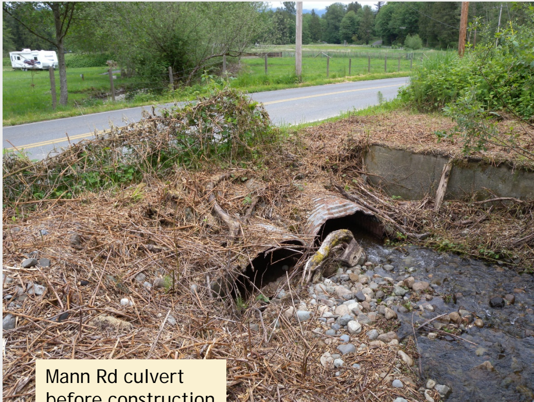
Mann Rd culvert before construction