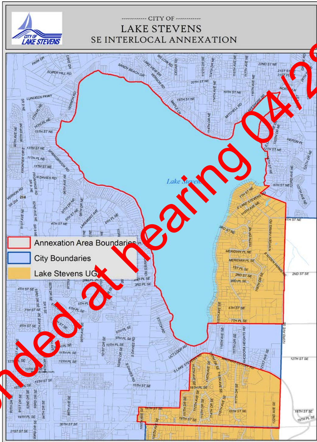
EXHIBIT A – Southeast UGA Annexation Map

INTERLOCAL AGREEMENT BETWEEN THE CITY OF LAKE STEVENS, SNOHOMISH COUNTY, AND THE LAKE STEVENS SEWER DISTRICT CONCERNING THE SOUTHEAST INTERLOCAL ANNEXATION AND THE ORDERLY TRANSITION OF SERVICES PURSUANT TO RCW 35A.14.296