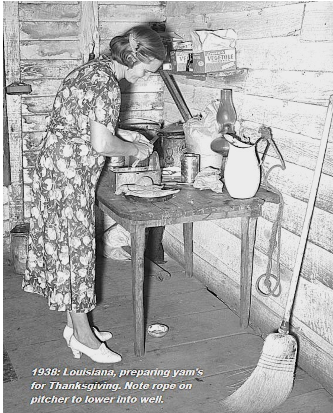
1938: Louisiana, preparing yam's for Thanksgiving. Note rope on pitcher to lower into well.