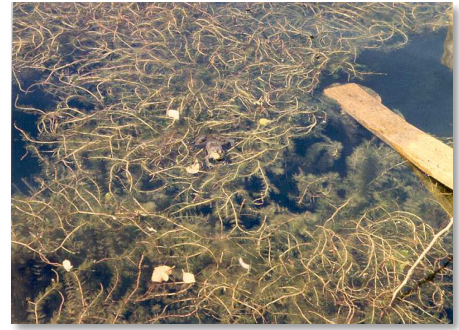
MILFOIL FORMS DENSE MATS THAT LIMITS SWIMMING, BOATING AND FISHING

Eurasian watermilfoil (milfoil) presents a high risk to the lake as it can significantly alter aquatic ecosystems and impair recreation. It creates large stands in up to 15 feet of water with vegetation creating a tangled mat up to the lake surface. The current low levels of this plant in Lake Roesiger are a result of many years of diver hand-pulling by the County and Community Club. With limited funding, the current diving effort is minimal with 2-3 days of diving every other year which covers about half the lake. The lake is at high risk for rapid spread of milfoil.