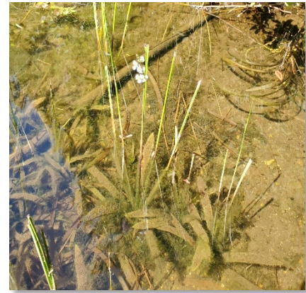
SLENDER ARROWHEAD CROWDS OUT BENEFICIAL NATIVE PLANTS

This spikey-leaved plant dominates over 40 acres of the lake’s shallow areas. It creates large monocultures where no other native plants can survive, harming important habitat and accelerating lake aging. While it has changed the lake ecosystem, the long-term impacts are largely unknown as Roesiger is one of only five lakes in WA with this largely unresearched plant. Because it is lower growing and does not normally reach the lake surface, it does not have as great of an impact on lake recreation.