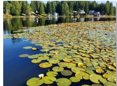
FRAGRANT WATERLILY DECAY IS CAUSING THE LAKE TO FILL-IN MORE QUICKLY

The lake's most visible infestation includes 30 acres of this invasive ornamental lily introduced to the lake decades ago. Concentrated in the middle basin, dense pads have made navigation to and from homes nearly impossible and has caused rapid lake sedimentation, increased nutrient cycling, and caused the formation of mud islands. Left unchecked, the middle basin will continue to evolve into a shallow wetland cutting off navigation between the north and south basins.