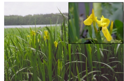
YELLOW FLAG IRIS

Management Goal: Prevent further spread, reduce current coverage and, if possible, eradicate small areas of invasive knotweed and purple loosestrife. Educate landowners on ways to manage or remove shoreline species on their property.