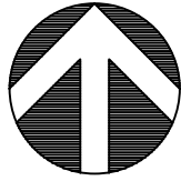
EXHIBIT "A" PAE FAA ATCT Transfer Agreement