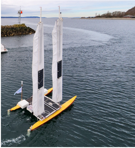
Prototype with SnoCoMakers

Third Annual Bluetech/Cleantech Innovation Cohort September - November