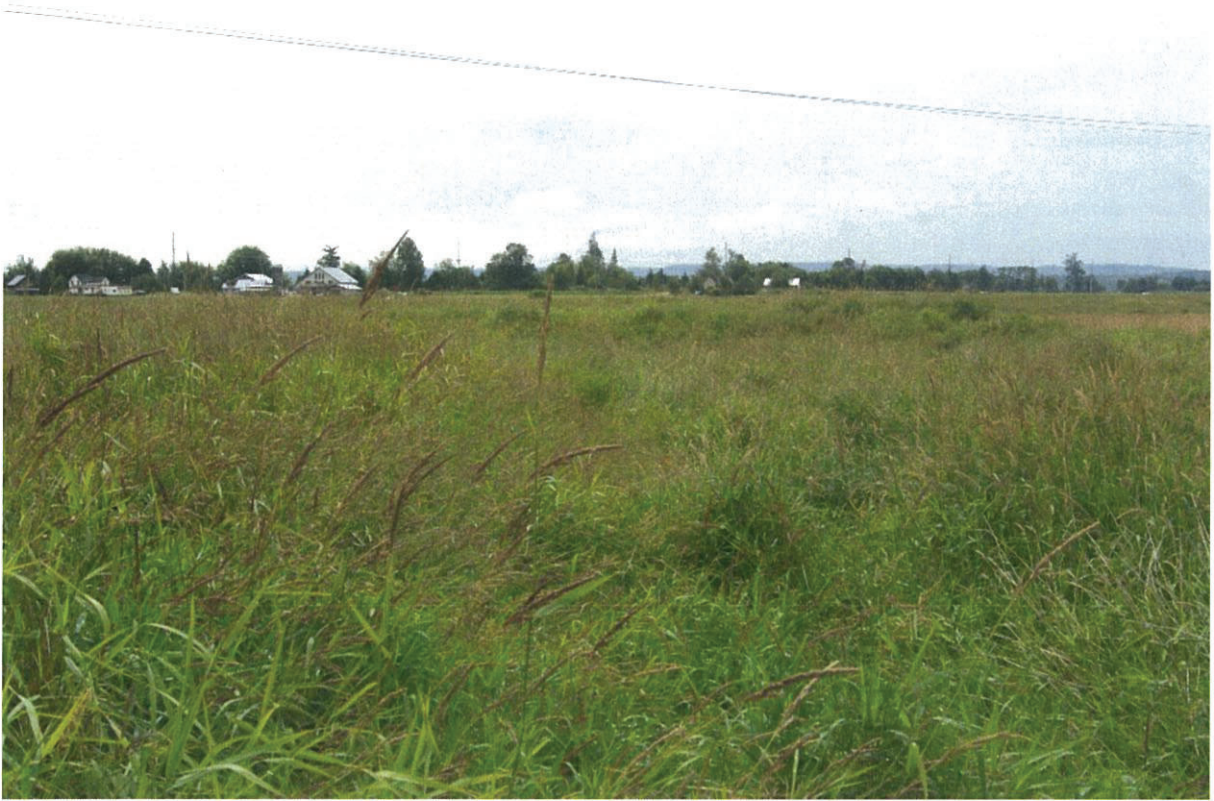
Attachment 2: Photo of reed canary grass over 6' high at Jorgenson Slough/Church Creek project site—taken on July 5, 2020