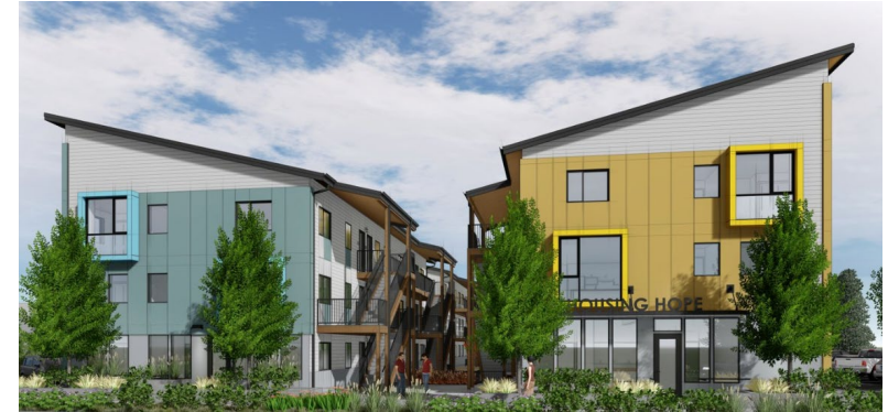
Madrona Highlands, Housing Hope and Edmonds Lutheran Project.

Rendering by Designs Northwest Architects