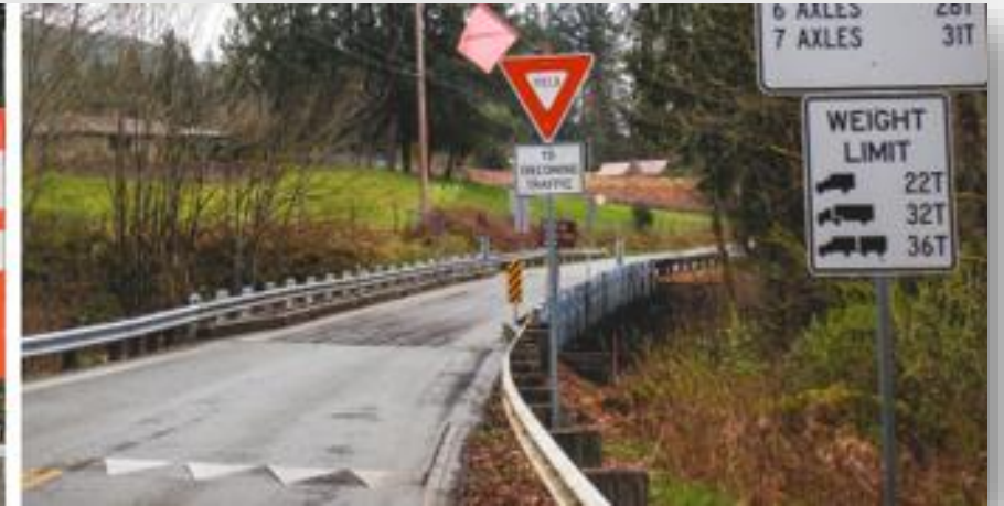
◀ bridge restrictions