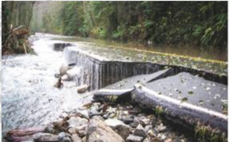
◀ storm damage