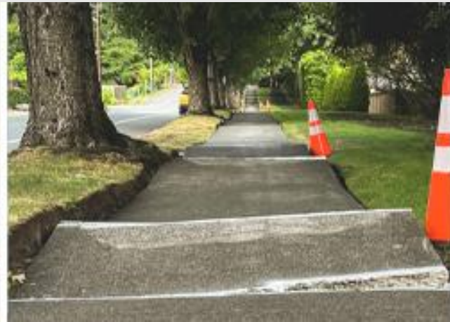
◀ sidewalk discontinuity